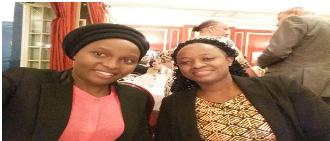
At Royal Automobile Club during symposium Dinner with a colleague.